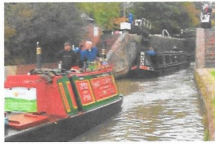
Historic nb Spey using HVO